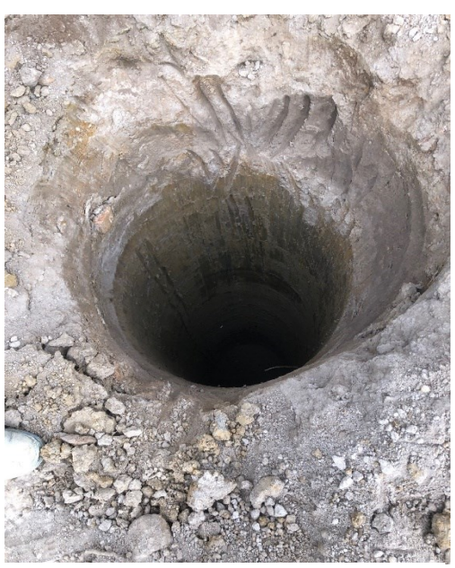
6 Metre Deep Pier Drilling