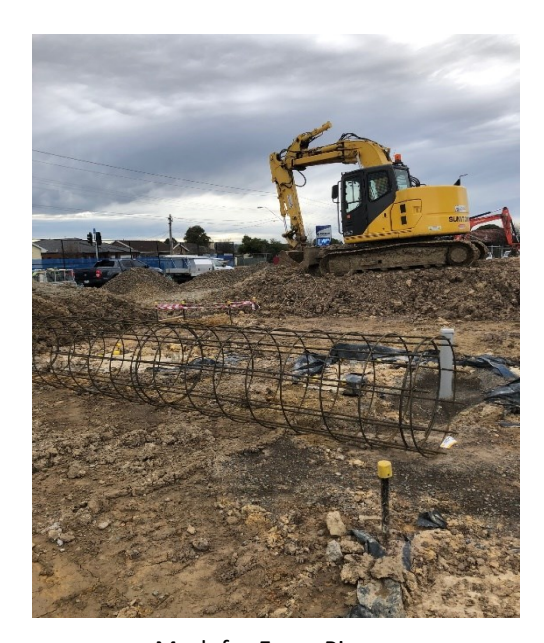
Mesh for Every Pier