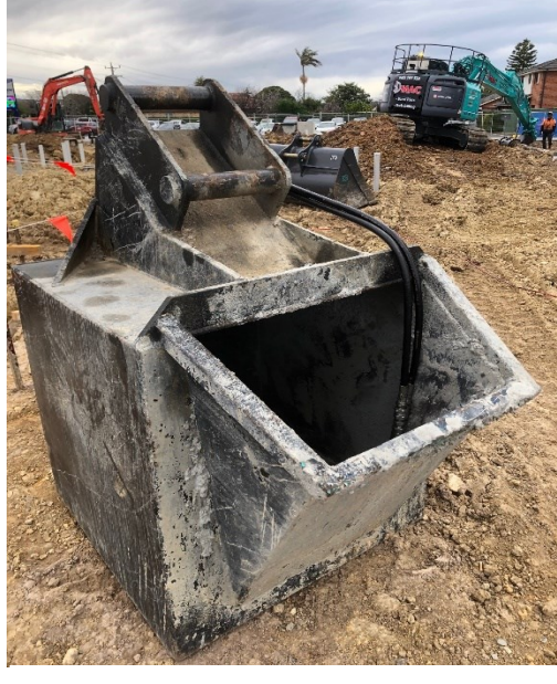
Concrete Bucket specially made for the Emerson job