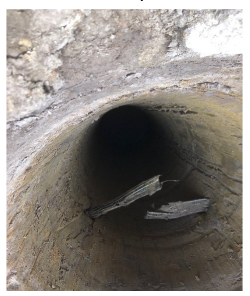
The Old Fibre Optic Cable