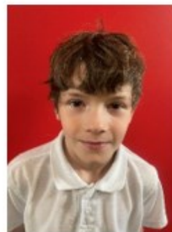
Kaiser - JSG