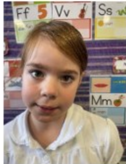
Charity - JSF