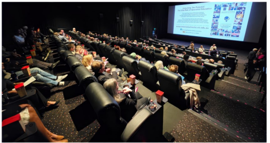
A full house watched Emerson School's award-winning film, Unlocking the Potential: The Vital Role of Specialist Education at Hoyts on 6 August.

He is a social media sensation known as @flavourfulflavour, winning hearts and likes online through his dancing and fun personality.